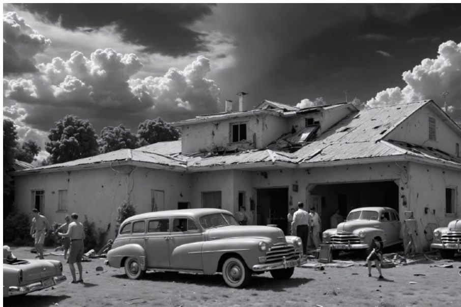
Burning and-a-Looting Tonight