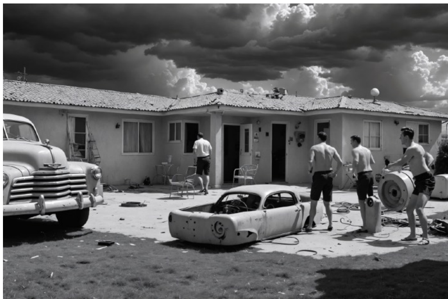
Weeping and-a-Wailing Tonight